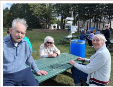
Outings to Buckhorn Pumpkin Patch, Algonquin Park and more!